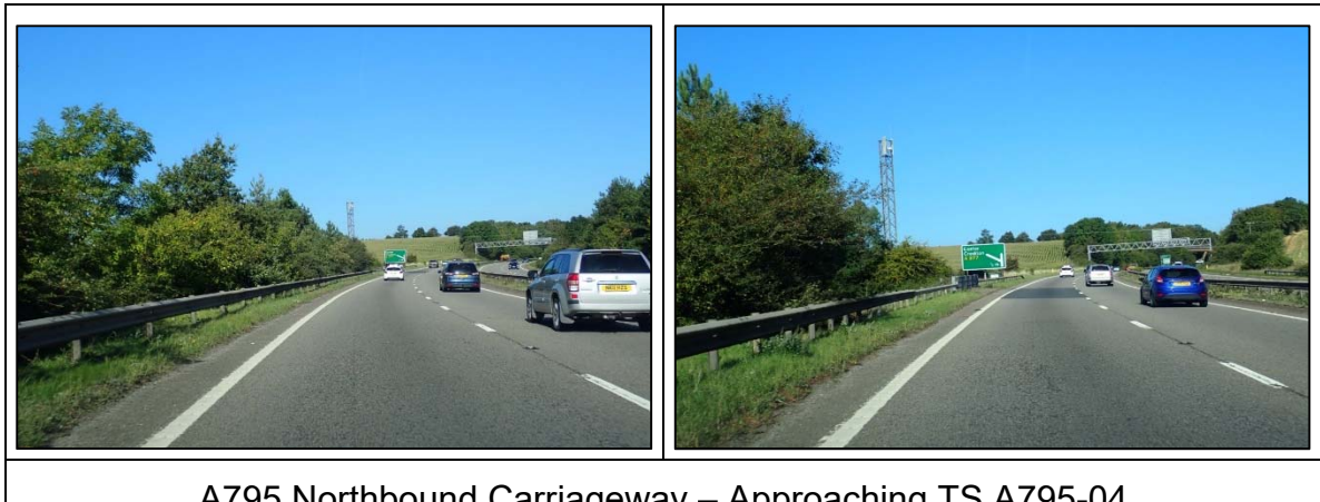
A795 Northbound Carriageway – Approaching TS A795-04

It is proposed to replace the existing ADS (TS A795-04) to a new location 5m in a northerly direction. The ADS is protected by the current VRS with an existing 8 metres of full height barrier after the sign assembly. The proposed location of the new ADS will place the new sign 5m north and in doing so, will only leave approximately 3m of full height barrier after this proposed assembly. The new location of the ADS in conjunction with the existing VRS may result in the VRS not performing as designed and increase the severity of injury to vehicle occupants if an errant vehicle left the carriageway at this location.