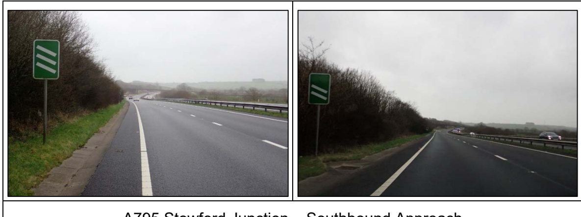
A795 Stowford Junction – Southbound Approach

The location of the southbound off slip is located on a gradual left-hand bend and is obscured by the current vegetation after the Advance Directional Sign. This vegetation, which is not in leaf, is also partially obscuring the countdown markers on the approach for this junction and could also obscure the visibility of the proposed Direction Sign. The vegetation clearance shown in the supplied drawing gives no dimension other than area. This may lead to insufficient vegetation being removed and compromise the forward visibility of the road layout being achieved and road users being unable to appreciate the approaching off slip. This could result in loss of control type collisions, risking injury to vehicle occupants.