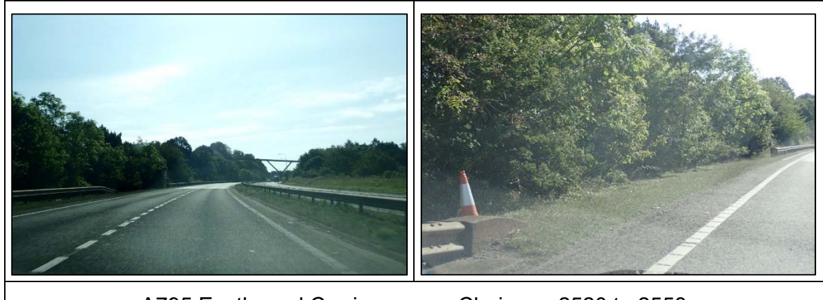
A795 Eastbound Carriageway – Chainage 2520 to 2558

It is proposed to close the gap in the existing VRS along the southbound carriageway towards the Stowford Junction. At present there is vegetation/trees in this location and appears to be within the working width of the proposed VRS, with no indication that this vegetation is to be removed. Any vegetation/trees that is within the working width of the proposed VRS could impede the operation if struck by an errant vehicle, increasing the risk and severity of injury to vehicle occupants.