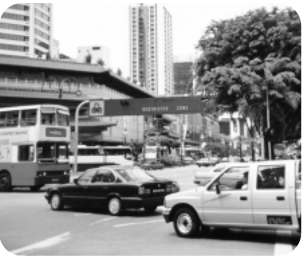
Access control in Singapore.

The aim of using congestion charging is to charge a price sufficiently high to promote modal shift and achieve transport policy objectives such as reducing congestion and encouraging a shift to public transport. Within this economic rationale sits the principle that the polluter pays. The aim may be to charge the economic price for the road space in order to promote the most efficient use of the facility and parallel facilities. This concept dates from the 1920s and was the basis for the Smeed report on road pricing, published in 1967. It is still cited today as the economic justification for road use charging, and is the basis of the road user charging projects currently being recommended to Local Authorities in the Transport Act (2000)1 and in the Greater London Authority Act (1999)<sup>2</sup>. A central tenet of congestion charging will be the collection of a considerable amount of revenue - a further important motive for introducing it (see The Hypothecation Issue).