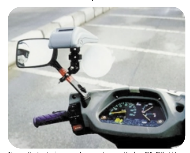
Waterproofing housing for transponder mounted on motorbike from CEC—SEEI trial in Singapore.

Alternatively, access to the city can be controlled by network restrictions, gates and priority controls and other traffic management measures such as the installation of "Intelligent Traffic Lights", for example the Split Cycle Offset Optimisation Technique (SCOOT) – which can also be specially adjusted to give priority to buses. All of these initiatives are consistent with road use charging and may, in fact, only be capable of realisation with the funds generated through a charging regime. As the Government has been urging for many years, ideally a package of measures should be used to relieve traffic congestion – without undue reliance on a particular measure.