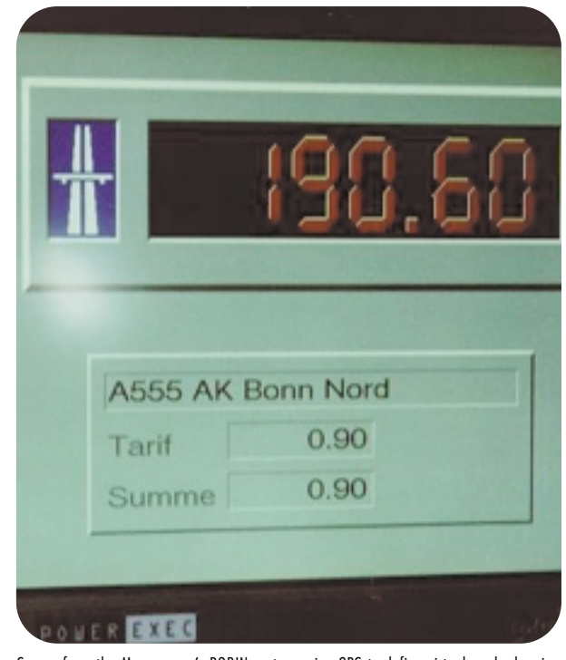
Screen from the Mannesman's ROBIN system using GPS to define virtual road—charging payment locations.

Electronic fee collection using the VPS method was trialled in Hong Kong during 1997–99 and was the method recommended to the Hong Kong Government at the end of the three-year trial. The main advantage of this method is that it does away with the need for expensive infrastructure.