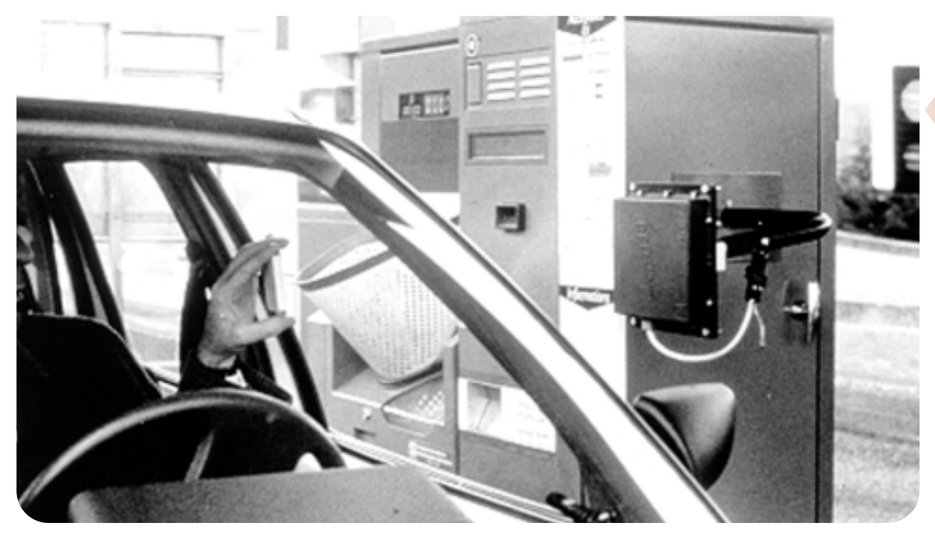
Smartcard and roadside automatic debiting equipment.

Whatever the method used, an effective billing system , (in the sense of the processing of millions of electronic debiting transactions daily) will have to be installed, involving the services of major IT service providers. The Department of the Environment Transport and the Regions is keen that this should not involve a "re–invention of the wheel" by each Local Authority as it installs congestion charging.