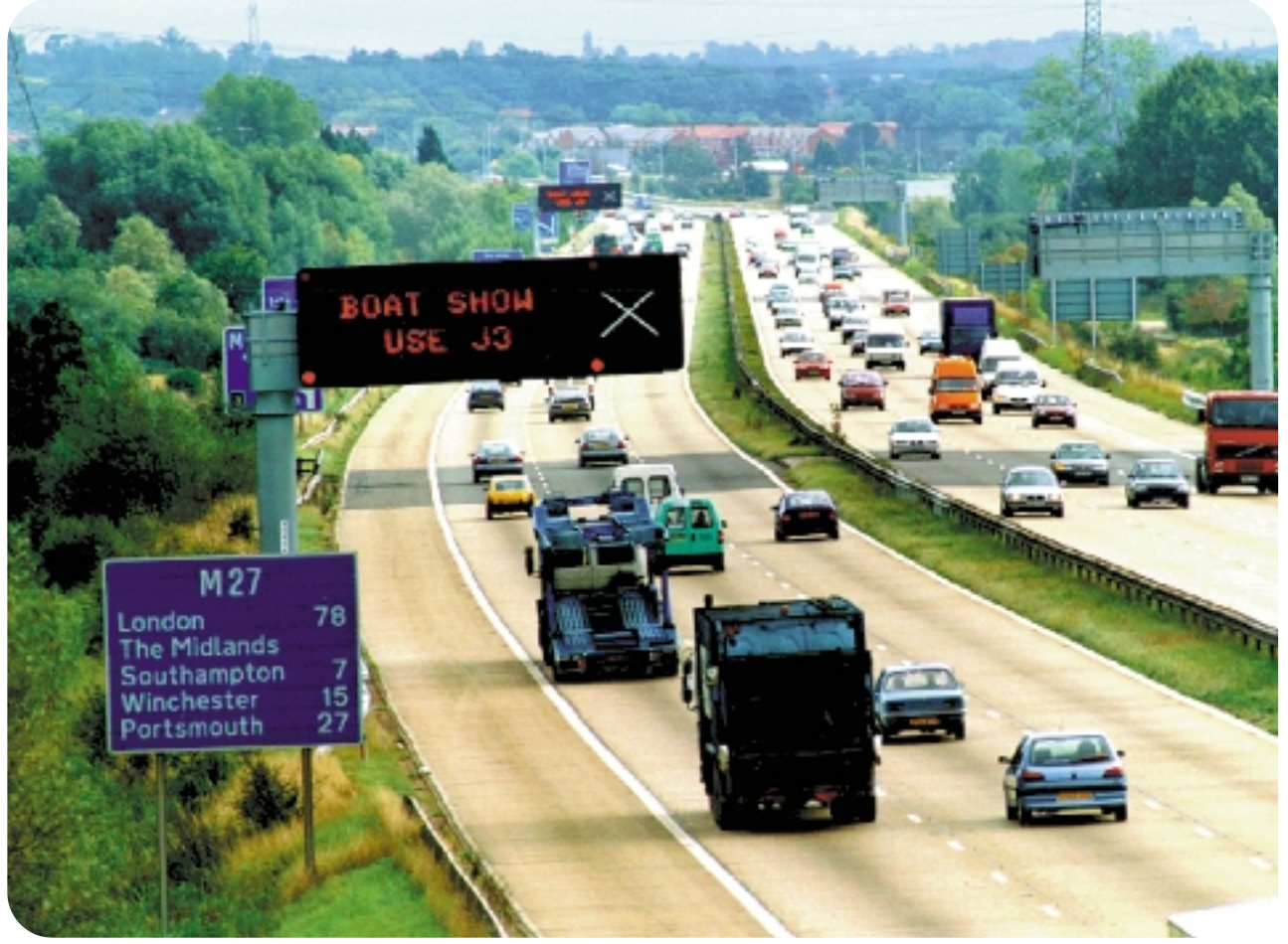
Use of VMS for strategic re-routing.

Against a background of increasing car ownership, trip making and trip lengths, further growth in traffic volumes on the inter–urban network is inevitable. Road building is no longer seen as an acceptable response. Every opportunity must therefore be used to operate the network to maximise