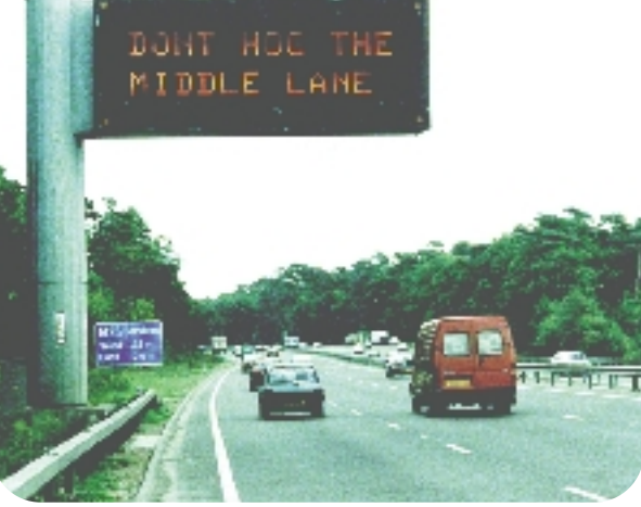
Electronic Variable Message Sign (VMS).

At the strategic level the new text-based Variable Message Signs (VMS) comprise two or three rows of 18 characters to form an appropriate message. The new generation MS3 VMS incorporate a matrix area. They can advise drivers of congestion ahead and give directions for alternative routes. VMS can be augmented with lane control signs and mandatory speed limit roundels or pictograms.