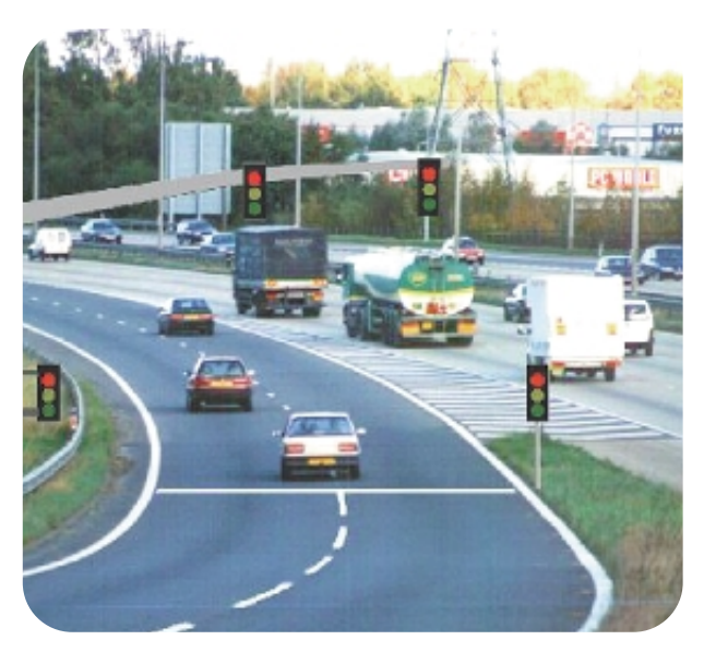
Ramp meters control access to the motorway.

Lane control is normally associated with tidal flow schemes on urban routes such as the Aston Expressway, Birmingham and the Blackwell tunnel approach. Other kinds of lane control schemes are now being introduced, such as high occupancy vehicle lanes, goods vehicle–only lanes, or lanes reserved for buses and coaches. One example is the M4 spur into the central area of Heathrow Airport where a bus–only lane has been introduced linked to traffic signal priority for buses.