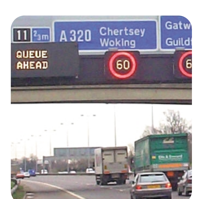
Variable mandatory speed limit signs (M25). (Highways Agency).

performance in terms of traffic capacity and minimise accidents and delays. The methods described in this note contribute to this objective. Traffic Control Centres will be at the hub of these future systems.