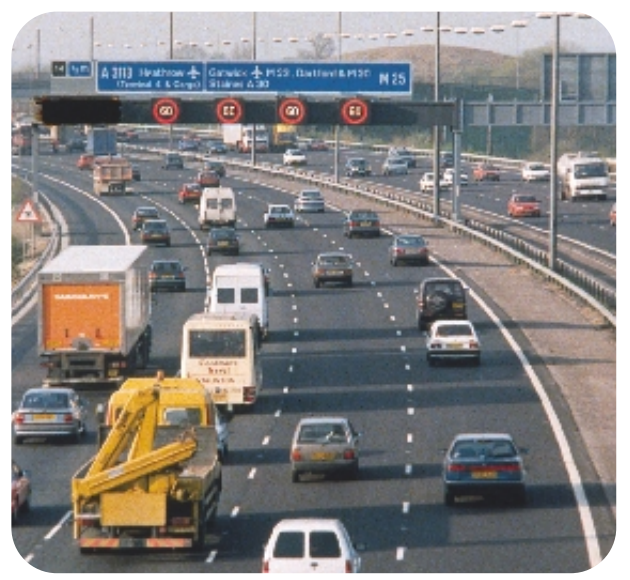
Speed-controlled motorway (M25).