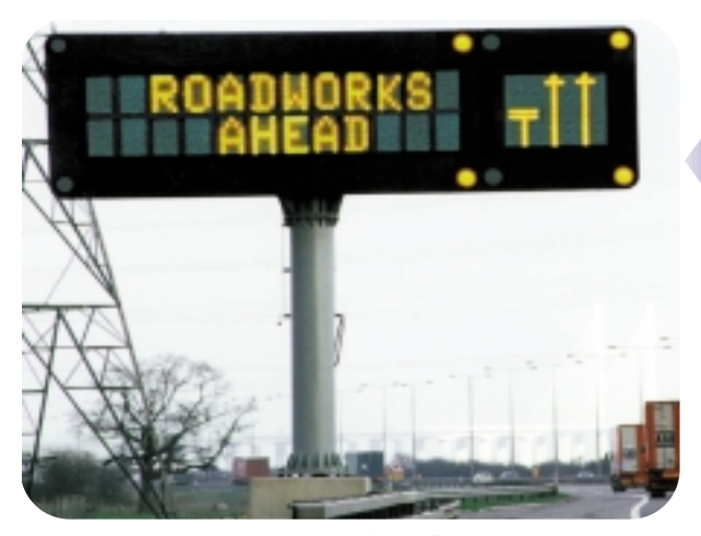
M4 motorway, South Wales. (Rolls-Royce).

7 Local Transport Today issue 207 13 March 1997 p7.