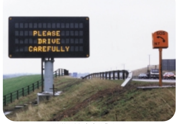
NADICS VMS Scotland. (Rolls-Royce).