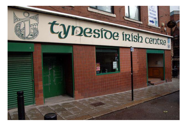
Tyneside Irish Centre – where highways and transportation quiz dreams are made.

For more information on this please visit the website and to book your place please contact the Committee at northeastandcumbria@ciht.org.uk