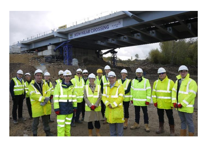
Visitors from the CIHT (North East and Cumbria) branch and Representatives from the New Wear Crossing.

The Region thanks Sunderland City Council and the Farrans project team on-site. We look forward to seeing this scheme come to fruition during the Spring of 2018.