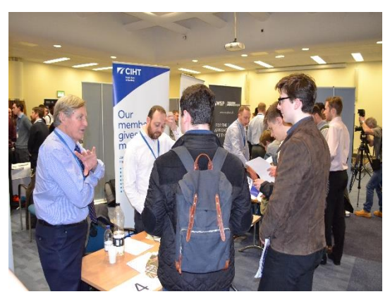
Members of the NE&C promoting the Institution to prospective members

At the heart of the Region, the Northumbria Subgroup are continuing to push ahead and deliver the majority of the events within the Region. With the help of local employers, Guest Speakers and the dedication of Committee Members we continue to identify and deliver the majority of the annual program in this location. In the coming months additional events are planned to be delivered which includes the annual Quiz, Young Persons Presentation Evening and the AGM.