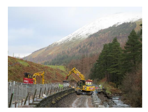
The A591 under reconstruction in Cumbria following Storm Desmond

Whilst the smallest of the sub groups Cumbria have recently delivered a committee meeting in the region in addition to a Committee meeting in Carlisle. The priorities of the group in the coming months is to continue to promote the presence of the Sub Group through emails, networking with local employers and engaging with the other professional institutions.