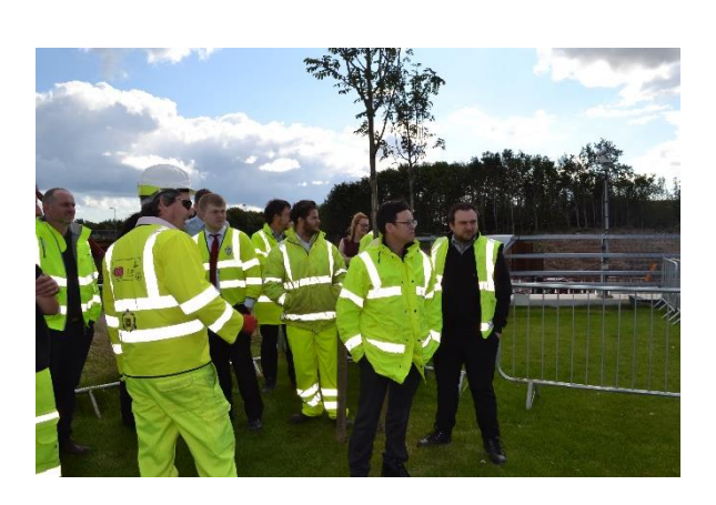
The A19 under construction at Silverlink (left) and members of the NE&C Region on site viewing the Projects development (right)