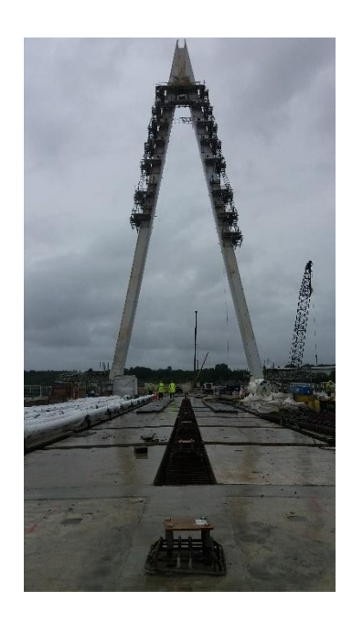
CIHT members walking across the NWC bridge deck

Construction is scheduled to last until 2019 and will unlock. To follow its progress, please visit the official website.