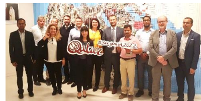
Photo from "Road to 2022 tour" event at the Headquarters of Supreme Committee for Delivery and Legacy (read more on page 2)

We would like to thank all those who support us either through sponsorship or through knowledge sharing.