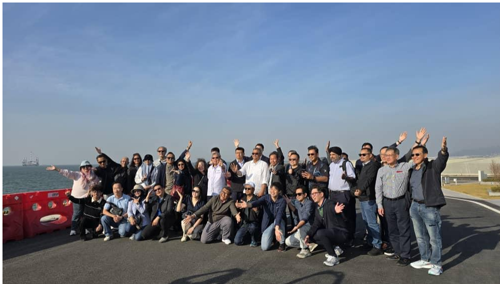
Group photo during delegations visit to Shenzhen-Zhongshan Link Museum

The delegation commenced the visit with a tour of the Shenzhen–Zhongshan Link Museum , located on the West Artificial Island. The museum features comprehensive exhibits and interactive displays that showcase the planning, engineering innovations, and construction milestones of the project.