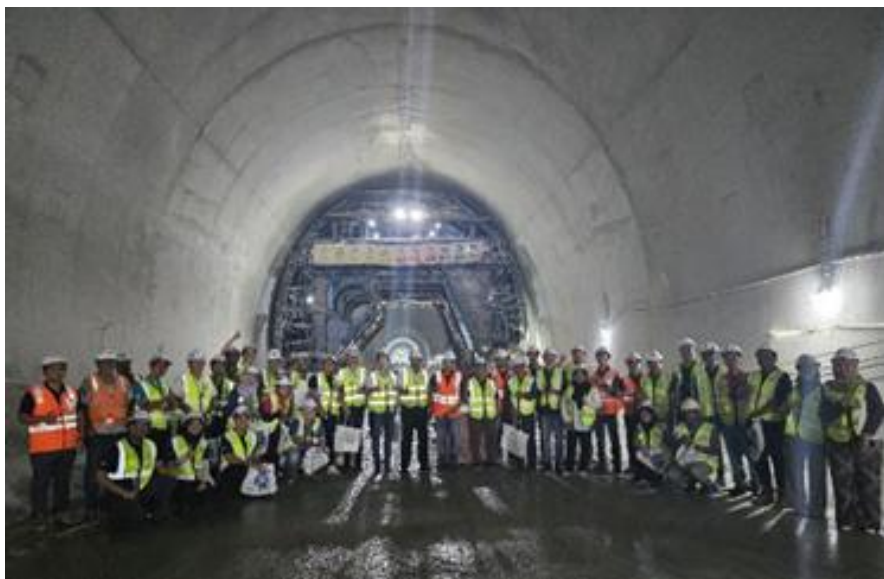
Malaysia Rail Link Sdn. Bhd. (MRL) and China Communications Construction Company (CCCC) with participants in Serendah Tunnel.

The Serendah Tunnel Technical Visit in September 2025 was a significant event for CIHT Malaysia, as it showcased one of the most ambitious infrastructure projects in the country. The event was regarded as a success with 30 participants joining from the Transportation Sector.