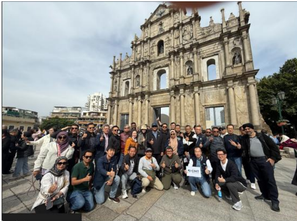
Group photo during the Visit to the Ruins of St. Paul's

Following a period of intensive professional engagements, discussions, and knowledge exchange, the delegation was scheduled for a period of cultural enrichment. The itinerary included a visit to the Ruins of St. Paul's, where the delegation had the opportunity to appreciate its historical and architectural significance. This was followed by a visit to Senado Square, allowing the delegation to experience the vibrant local atmosphere, explore the surrounding heritage streets, engage in light retail activities, and sample a variety of regional cuisines.