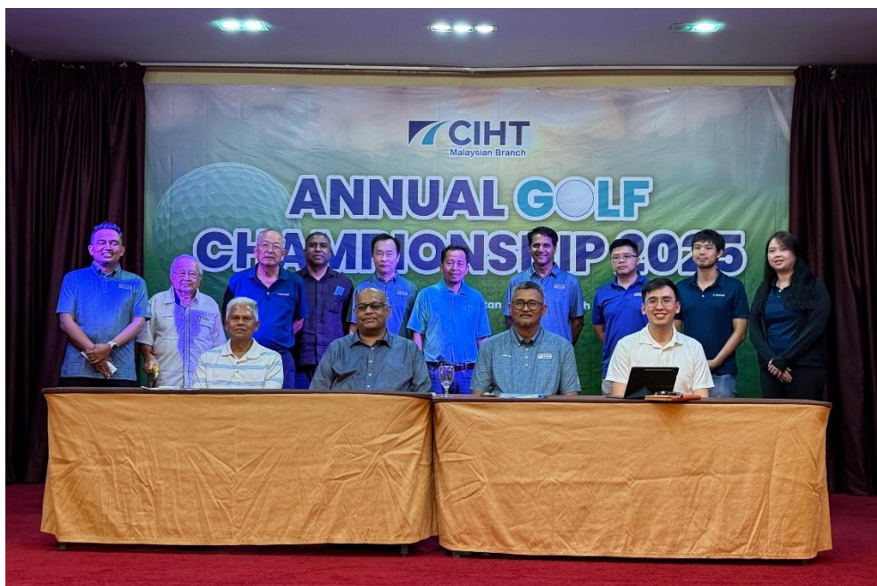
The Newly Elected Committee members together the past committee members

35 members attended the CIHTMB Annual General Meeting 2025 which was held at Kelab Golf Sultan Abdul Aziz Shah, Jalan Kelab Golf 13/6, Seksyen 13, 40100 Shah Alam, Selangor Darul Ehsan on 24 May 2025 (Saturday). It started at 1:30pm and this was an election year for new Committee for the term of 2025/2027.