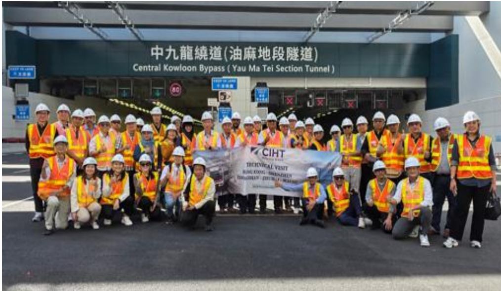
Group photo capturing CIHTMB delegation at the Central Kowloon Route Community Liason Centre for the Central Kowloon Bypass (Yau Ma Tei Section)

The CIHTMB delegation visited the Central Kowloon Route (CKR) Community Liaison Centre (Yau Ma Tei Section) for a technical briefing by ARUP on the 4.7 km dual three-lane highway, including a 3.9 km tunnel. Delegates also experienced a guided drive-through of the tunnel, gaining insights into urban tunnelling challenges and traffic management in a dense city environment.