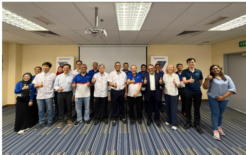
A successful engagement session between Prasarana Malaysia Berhad ,CIHT Malaysia and CIHT CEO and President