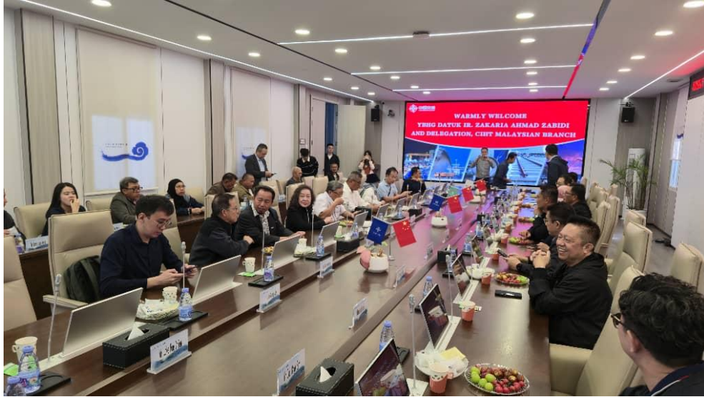
Senior engineers from CCC providing technical briefing to delegates on Shawan River Water Purification Plant Project

The delegation commenced the visit with a tour of the Shenzhen–Zhongshan Link Museum , located on the West Artificial Island. The museum features comprehensive exhibits and interactive displays that showcase the planning, engineering innovations, and construction milestones of the project.